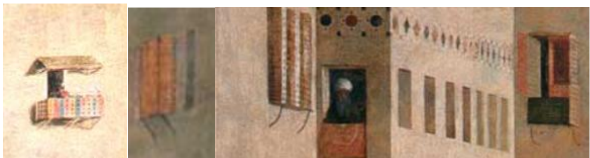
(Arabic-style latticed window covers; Saint Mark preaching in Alexandria, Gentile and Giovanni Bellini, 1505)

The next interesting feature, although very subtle, also add to the element of exoticism or giving a sense of the 'foreign' to the viewers of the painting, who would be Venetians who knew nothing or next to nothing about the cities of the East and the way of life there. These would be the slatted window-covers that characterise a lot of architecture that can be found even today, in cities like Cairo and other Arab cities of the time. While these were for mostly cosmetic purposes, they also ensured that the windows were protected from the public eye and not a lot of people could see what was going on inside. While the detail is very subtle, and does not make a difference to the overall aesthetic sensibilities of the work, it nevertheless is a very nuanced touch that warrants a mention.