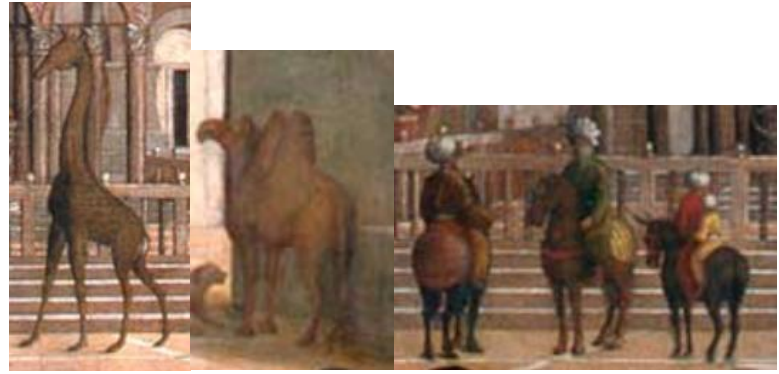
(Various 'exotic' animals; Saint Mark preaching in Alexandria, Gentile and Giovanni Bellini, 1505)

Slowly moving behind layers of the painting, now turning our attention behind the actual congregation, the portico of the domed structure, here we are presented with a varied number of scattered groups of people, who seem to be bearing no interest in the actual congregation. They seem to be engaged in their own activities within these sparse groups. While nothing special, this connotes that in the city of Alexandria, being as cosmopolitan as it was, sermons and speeches of this order by representatives of various sects and religious order was not as uncommon as one might think. Moreover, on a closer look, one also sees elements like camels, horses and a giraffe, that one might assume are being traded. Painted by an Italian, these items bear a very strong element of exoticism since all of these are sights that were highly novel in their own realm. Bellini(s) use these elements to reinforce the fact that the surroundings of the paintings were in fact foreign if people could not make that out. This might also be a nod to the widespread trade of items that was taking place during the time.