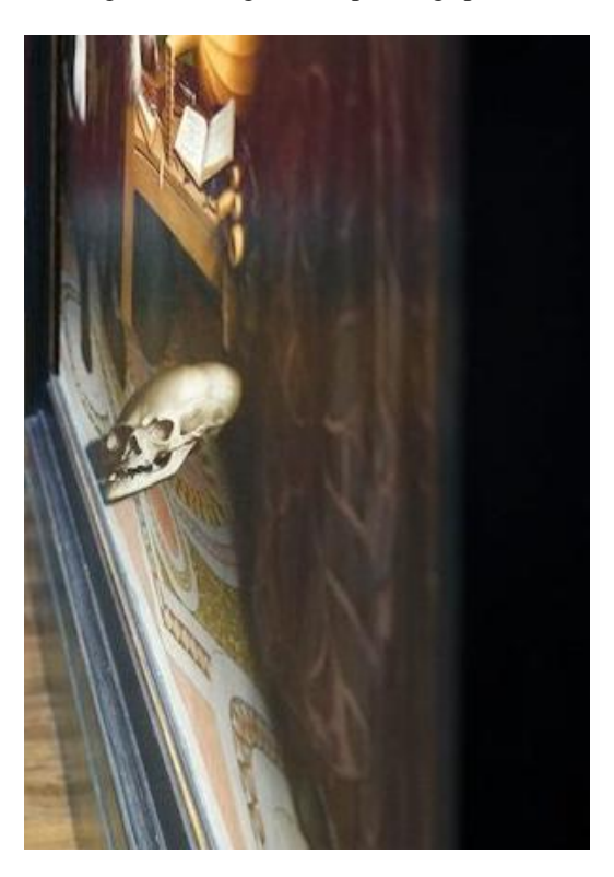
(Anamorphic image of skull; The Ambassadors, Hans Holbein the Younger, 1533; National gallery, London)

At the very beginning, on a rudimentary look at the surroundings, and some moderate reading one gathers that the floor the two men are standing on, it is situated inside the Westminster Abbey, with the floor being a characteristic feature of this location. This tells us that the two characters were in England when the painting was made at the time. Also, on the floor is a smear, that has elicited much controversy. However, on changing perspective, the viewer comes to notice that this smear is indeed the anamorphic image of a skull and it can be viewed on looking from the right-most edge of the painting (pictured below).