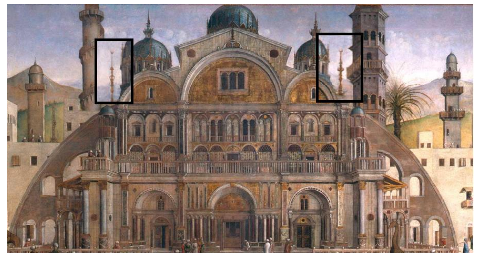
(Structure with multiple visual and symbolic cues; Saint Mark preaching in Alexandria, Gentile and Giovanni Bellini, 1505)

Now coming to the actual structure, which occupies a significant amount of the viewer's perspective, on first thought, one might just assume it to be a mosque, due to the usage of domes that characterises Islamic architecture. However, on reading into it, multiple contradictions arise. Only with some surface level reading, what we come to see is that this use of domes can also be found in many other structures, churches of the eastern orthodoxy included. So, we are led to question, what indeed it this structure? Is it a mosque? Is it an eastern orthodox church? Is it a shrine dedicated to the many gods worshipped by the local polytheists? Some argue that the crescents next to the two outermost domes might be characteristic of Islam, however, others also argue that these could be symbolic of the gods of the Egyptian or Greek pantheon, both of which use the crescent symbol excessively.