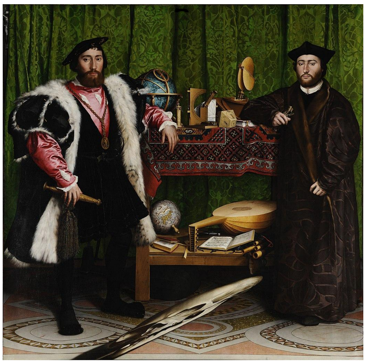
The Ambassadors, Hans Holbein the Younger, 1533)

On first glance this painting is just two men, looking rather grim, standing next to an array of items that represent a varied set of interests, or a scatter of random items. However, there is a lot more to the same than that. There are multiple levels to analyse this painting, and instead of following a method where it would serve a better purpose when separating the elements and individually analysing them; what we would attempt to do with